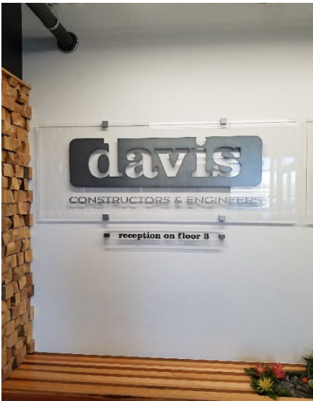
Davis Constructors and Engineers

Each quarterly newsletter will spotlight one CHASE Partner. The idea is to highlight a company that provides critical infrastructure to our state. As the CHASE program continues to grow, AKOSH Consultation expects to highlight other partners that work with our program, as well as various associations. This quarter we are shining the spotlight on Davis Constructors and Engineers.